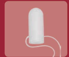
Incontinence Tampon Pessary Soft Type C